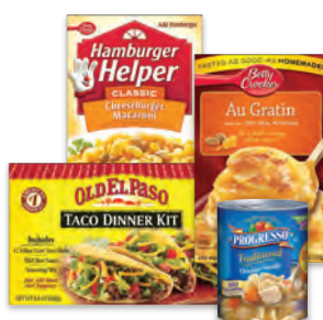
meals & sides